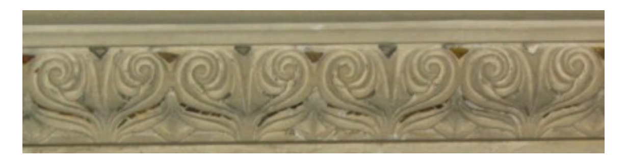
Figure 2: Figure for question V, part C