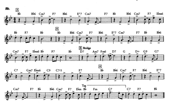
Figure: George Gershwin, I Got Rhythm , (transposition, retrograde and inversion, all in one song!)

We call these four equal sections A, A, B, and A. Three of the sections are the same, and one is different. Listen to the first section, and you'll be able