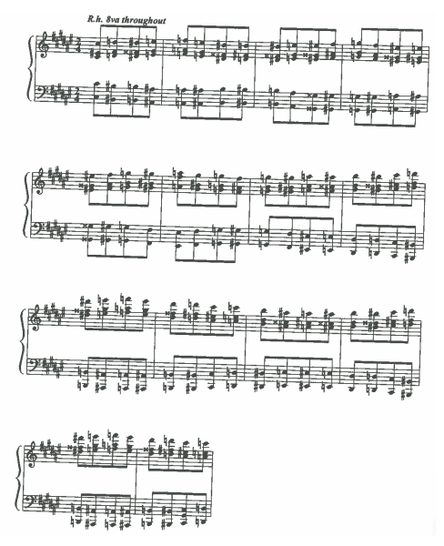
Figure: Franz Liszt, excerpt from Hungarian Rhapsody #2