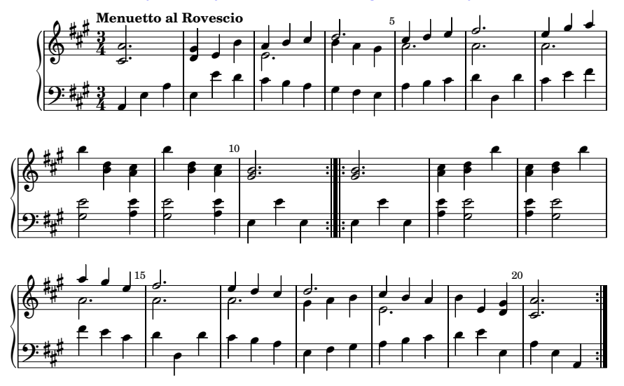
Figure: Joseph Haydn, Piano Sonata in A Major , (Hob. XVI/26; Landon 41) "Minuet in Reverse." Both the minuet and trio are exact musical palindromes.