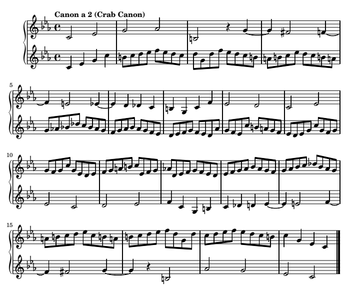
Figure: The Crab Canon from Bach's Musical Offering