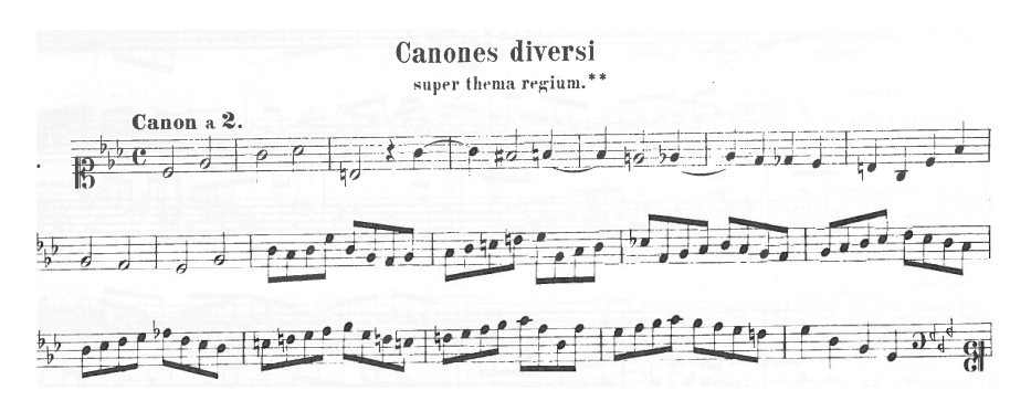
Figure: The unsolved version of one of Bach's canons from the Musical Offering . Notice the reflected clef and key signature at the very end of the piece.