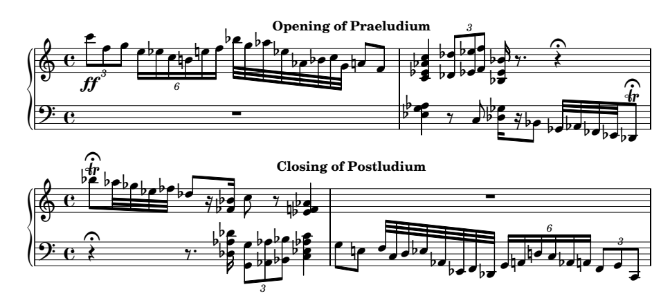
Figure: Paul Hindemith, Ludus Tonalis ("Tonal Game"), beginning and end. The ending Postludium is an exact retrograde-inversion (180° rotation) of the opening Praeludium.