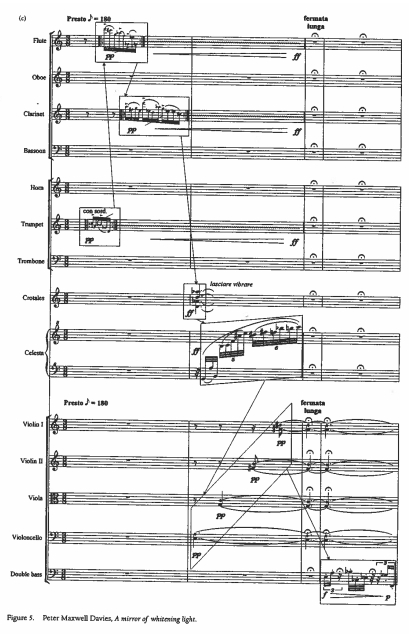
Figure: Opening to A Mirror of Whitening Light