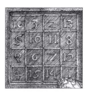
Figure: Dürer's Melancholia I, 1514