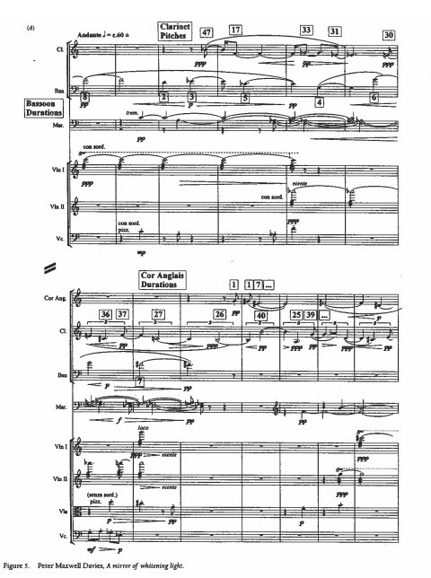
Figure: An example of durations based on the magic square.